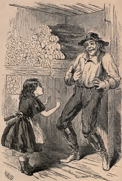
A DARK DAY. — Page 154.